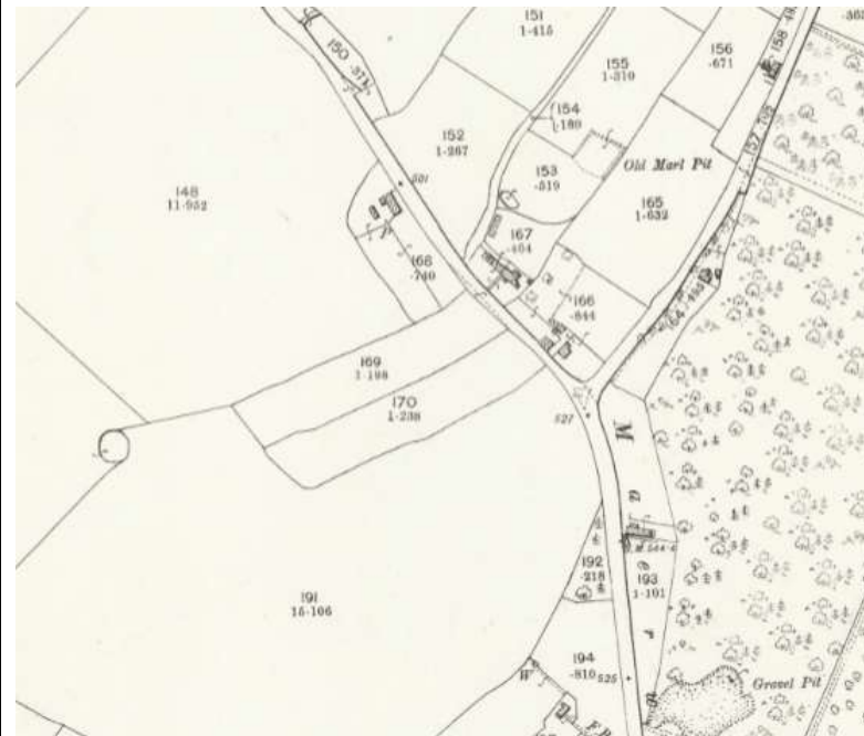
OS Map 25" to the mile, published 1901